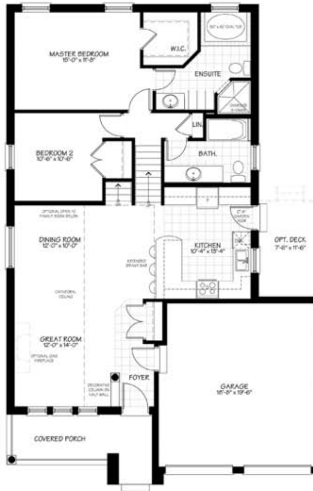
ALTERNATE MAIN FLOOR 1,327 sq. ft.